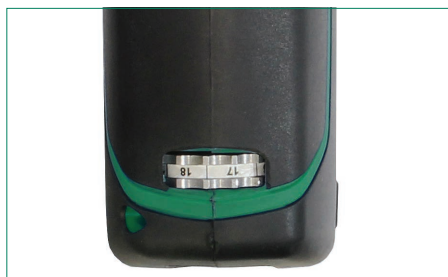
Mode dial to manually adjust the pressure (settings indicated on the machine housing)