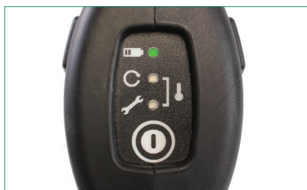
Status lights on the back of the machine housing