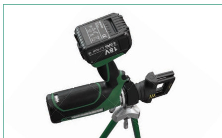
Assembly machine attached to a tripod stand using a mounting bracket