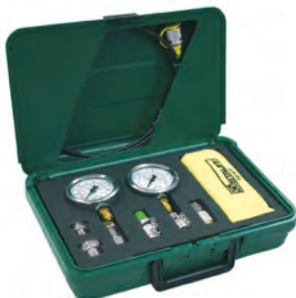
SMB20-2-xxx/xxx-C6F or SMB15-2-xxx/xxx-C6F