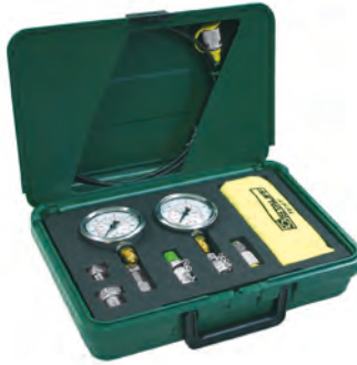
SMB20-2-xxx/xxx-C6F or SMB15-2-xxx/xxx-C6F