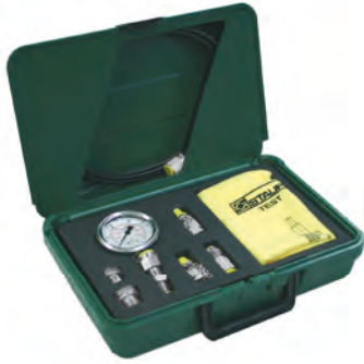
SMB20-1-xxx/xxx-C6F or SMB15-1-xxx/xxx-C6F