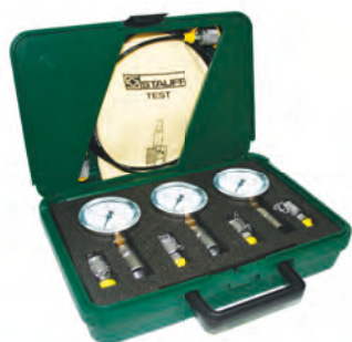
SMB20-3-xxx/xxx-C6F or SMB15-3-xxx/xxx-C6F