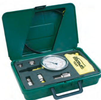
SMB20/100-1-xxx-C6F or SMB15/100-1-xxx-C6F