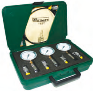
SMB20-3-xxx/xxx-C6F or SMB15-3-xxx/xxx-C6F