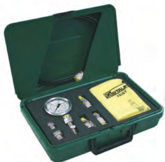
SMB20-1-xxx/xxx-C6F or SMB15-1-xxx/xxx-C6F